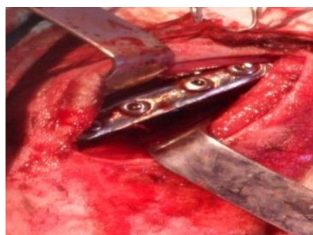
Fig. 2: Plate insertion in the lateral face of femur