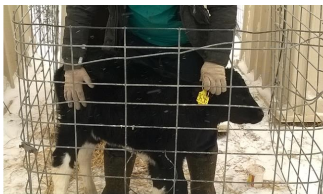
Figure 1. A Holstein heifer in control group did not receive cuprum nanopowders at the the first month of the Experiment.