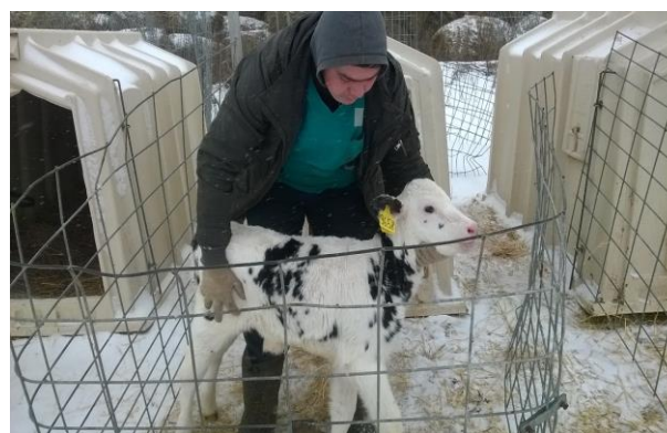
Figure 2. A Holstein heifer in treatment group received cuprum nanopowders at the first month of the Experiment.