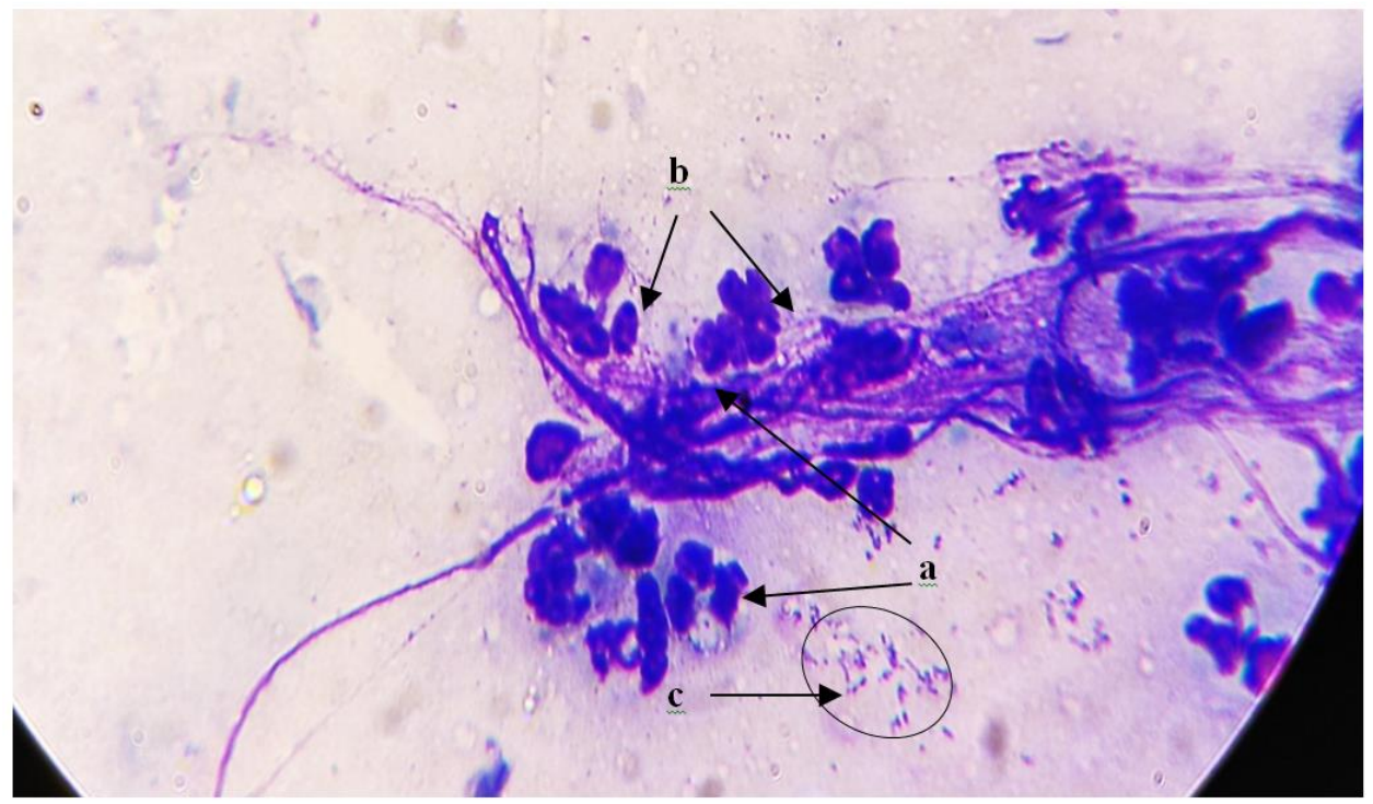
Figure 2. Cytology diagnostic of feline inflammatory aural polyps of a 4-year-old, female spayed, Scottish fold cat. a : visualization neutrophils. b : formed extracellular protective traps, in which microorganisms were fixed ( c ). Magnification x2000, stained with May-Grünwald