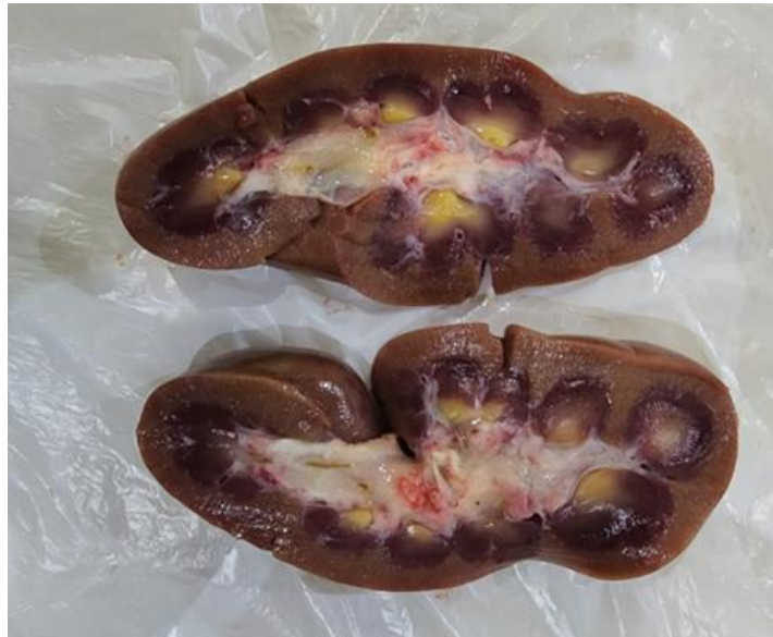
Figure 2. Morphology of three years old female Bali cattle (left kidney)