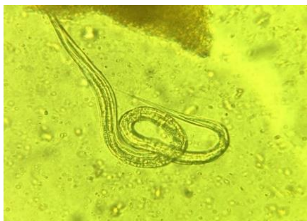
Figure 1. Larva of Dictyocaulus species extracted from Blue Bull in September 2020 from Ayub National Park, Rawalpindi, Pakistan. The image was obtained using 40x power of magnification.

Figures 1-4 present microscopic images of endoparasites, namely Dictyocaulus species, Trichuris species, Strongyloides species, and Taxocara species. The direct smear method and Microscope image processing technique were used to get a detailed and magnified image of the parasites.