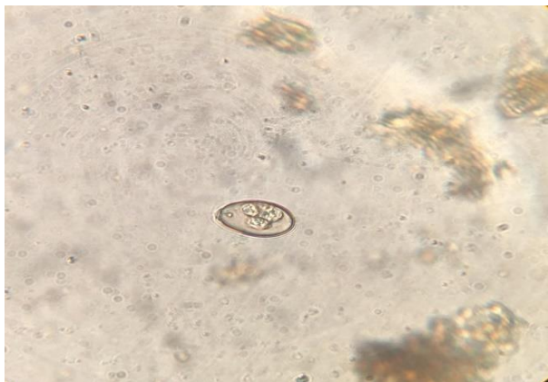
Figure 3. Ova of Strongyloides species from Urial in September 2020 from Lohi Bher Wildlife Park, Rawalpindi, Pakistan. The image was obtained using 10x power of magnification.