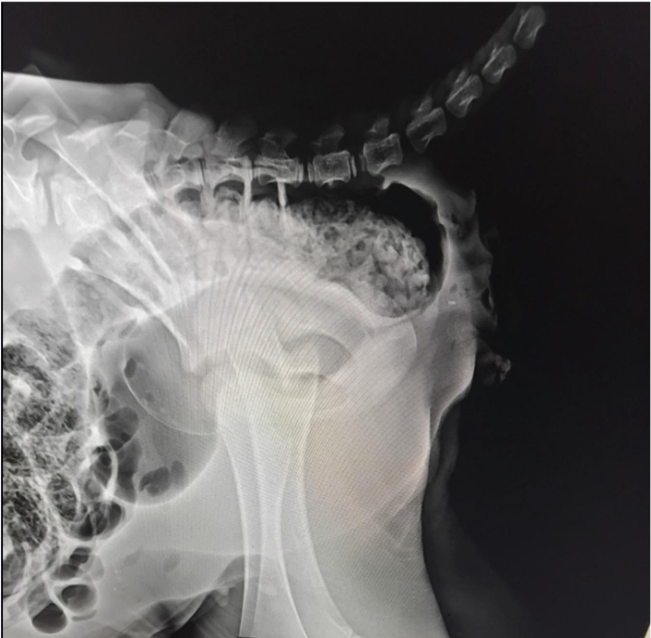
Figure 1. The caudal end of the rectum in a 4-day-old Brown Swiss calf

Lateral radiographs indicated a blind-ended rectal pouch located approximately 2 cm from the perineal skin, with no external communication (Figure 1). Marked distension of the rectum and colon was noted, characterized by fecal and gaseous accumulation proximal to the obstruction. Dilatation of the distal intestinal loops confirmed a complete functional obstruction. No major bony malformations or additional spinal or abdominal abnormalities were identified.