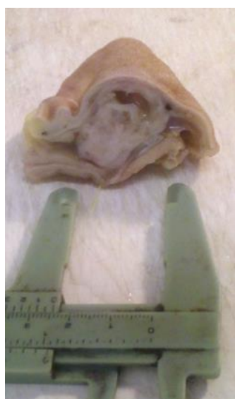
Figure 1. Macroscopic view of ISS sampled from a cat.

Macroscopically, ISS can be found as well-defined white and firm masses, usually centrally cavitated and containing liquid, which may be watery or mucinous (Hendrick et al. , 1992; Figure 1). Microscopically, their appearance varies depending on the degree of anaplasia and the type of sarcoma (Hendrick et al. , 1992). Regardless of the latter aspect, ISS are characterized by a perivascular lymphocytic infiltrate at the tumor's periphery (Figure 2), the presence of giant cells, and a prominent myofibroblastic component (Madewell et al. , 2001).